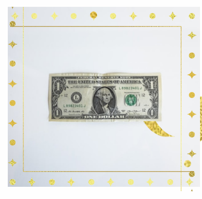
NeONBRAND - @neonbrand