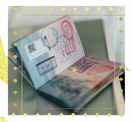
Elias Castillo - @eli_j

THE OUTLOOK ON H-1B VISAS AND IMMIGRATION IN 2022