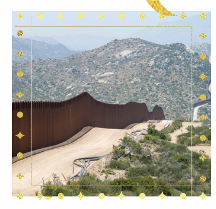
Greg Bulla - @gregbulla